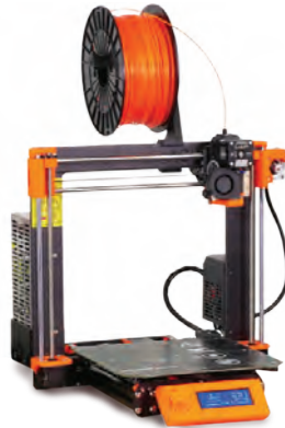
Prusa i3 MK3s